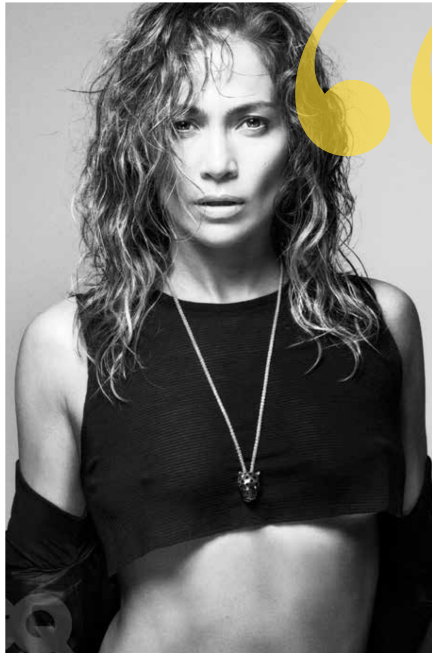
JENNIFER LOPEZ - PAGE 32

In this issue, we obsess over Jennifer Lopez and her phenomenal style that only seems to get better with time, and her most dazzling looks to date.