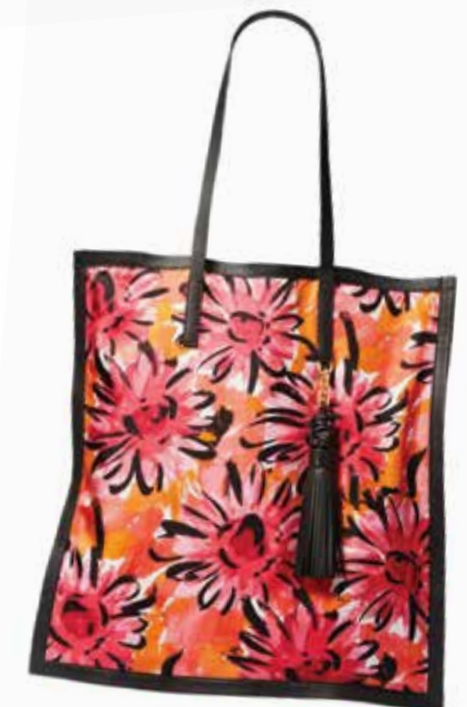
Michael Kors Grimaldi Sunflower Silk-Twill Scarf Tote