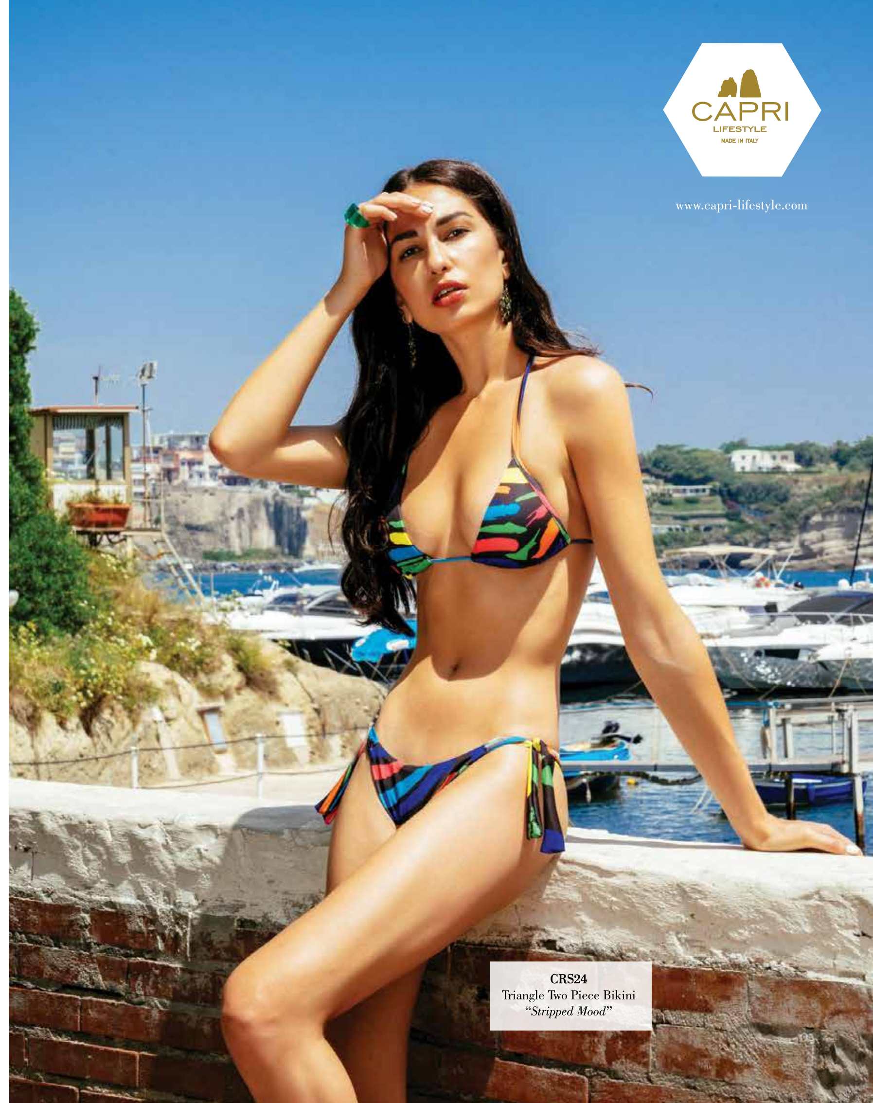
CRS24 Triangle Two Piece Bikini "Stripped Mood"