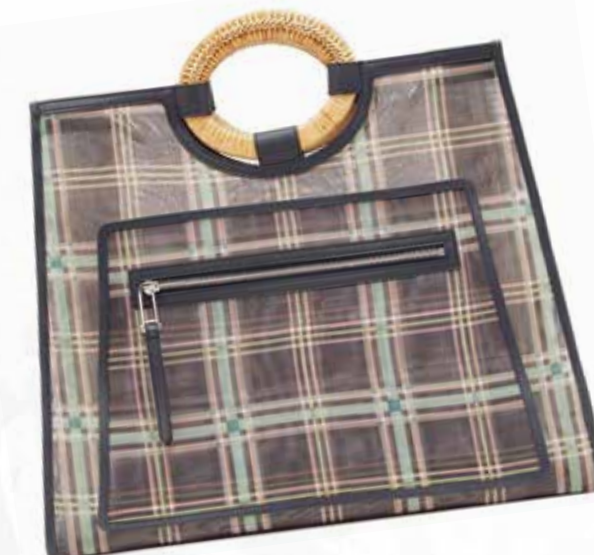
Fendi Runaway Shopper tote