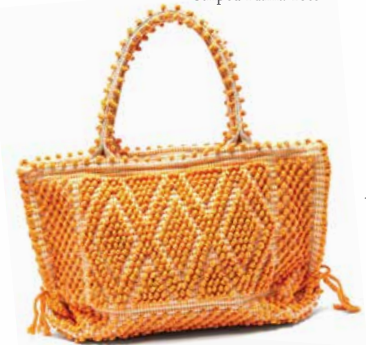
Antonello Tedde Rombi Medium Tote