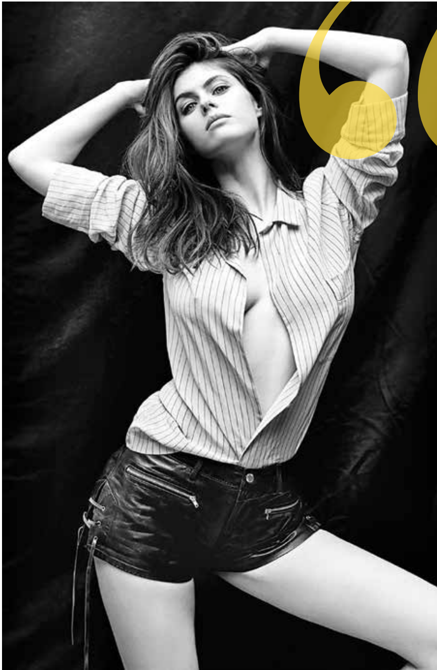
ALEXANDRA DADDARIO - PAGE 16

We are officially halfway through summer, yet the summer heat seems to be universally all prevalent. The last two months have streamed along at great speed with a plethora of events. With all the madness behind us there's a lot more awaiting in the remaining summer months. The latest issue of the First Avenue Magazine bring to you the best of what's up next!