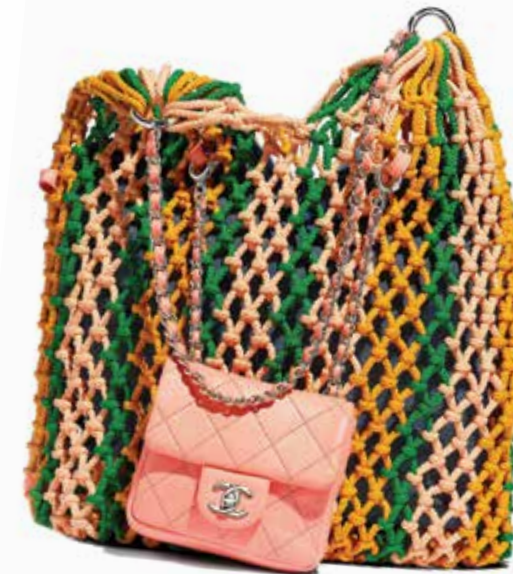
Chanel Mixed Fibers, Lambskin & Silver-Tone Metal