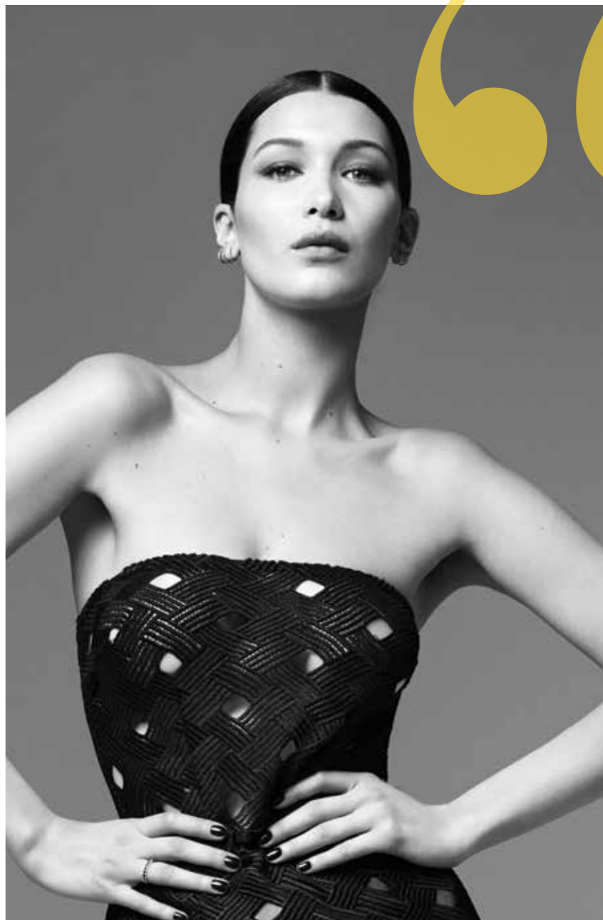
BELLA HADID - PAGE 20

Here's to yet another issue bursting – overflowing, even - with exciting, head-turning and most importantly, page-turning fashion.